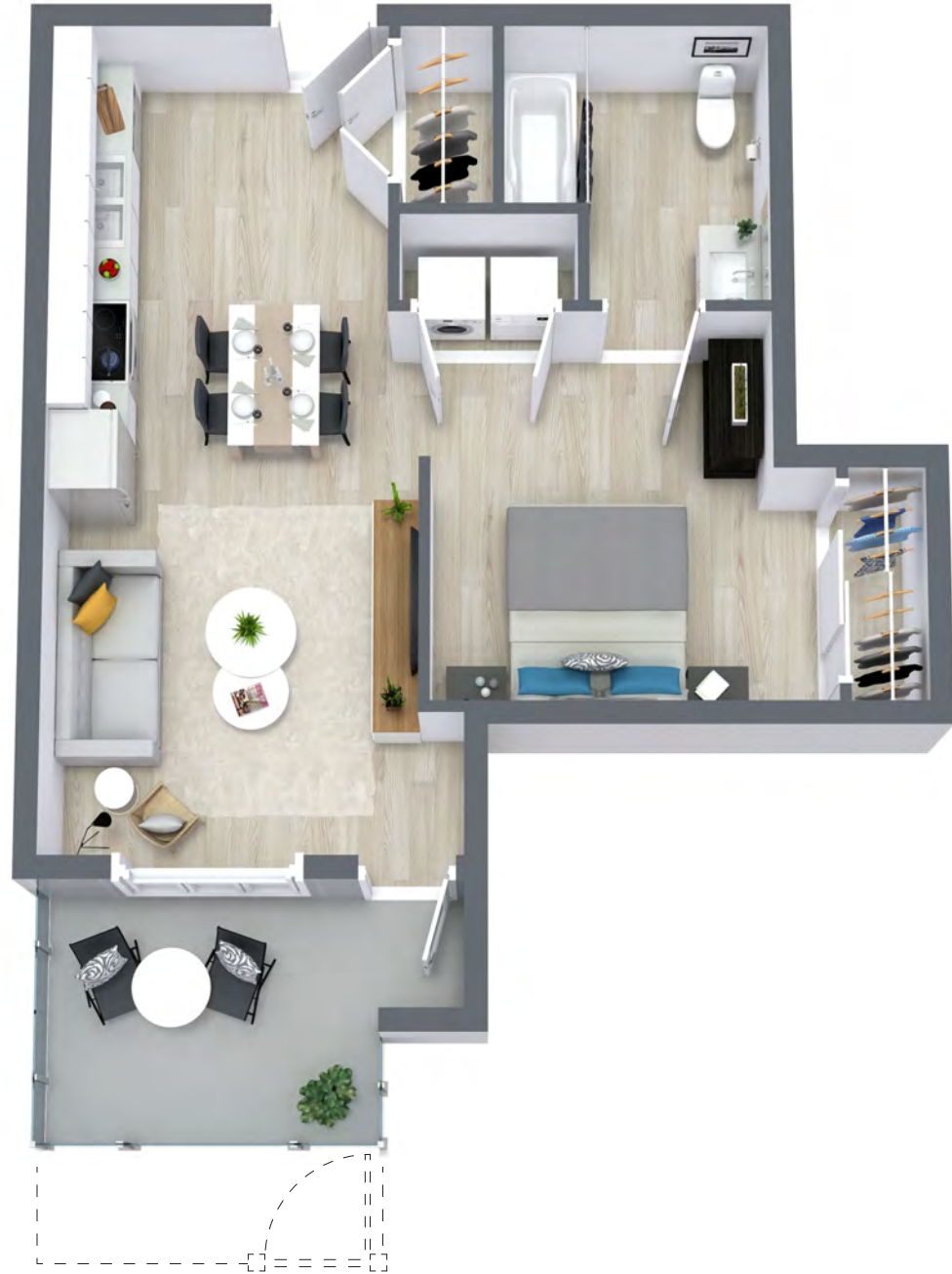
PATIO ON LEVEL 1 ONLY

All suite measurements are preliminary based on current building concept and unit configurations and are subject to change.