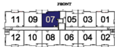
Building B Main Floor